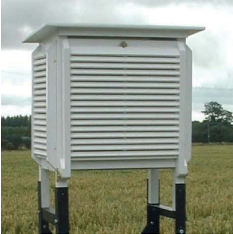
Photograph A for Question 1